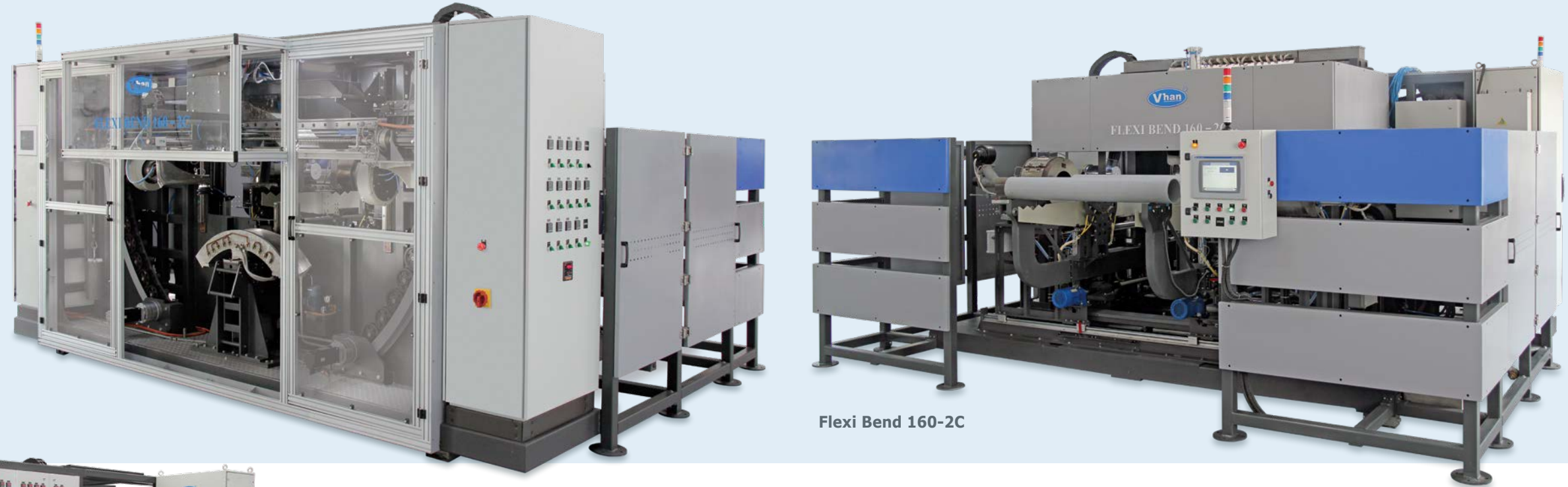
Flexi Bend 160-2C

Offline & Automatic cutting & feeding solutions (Optional)