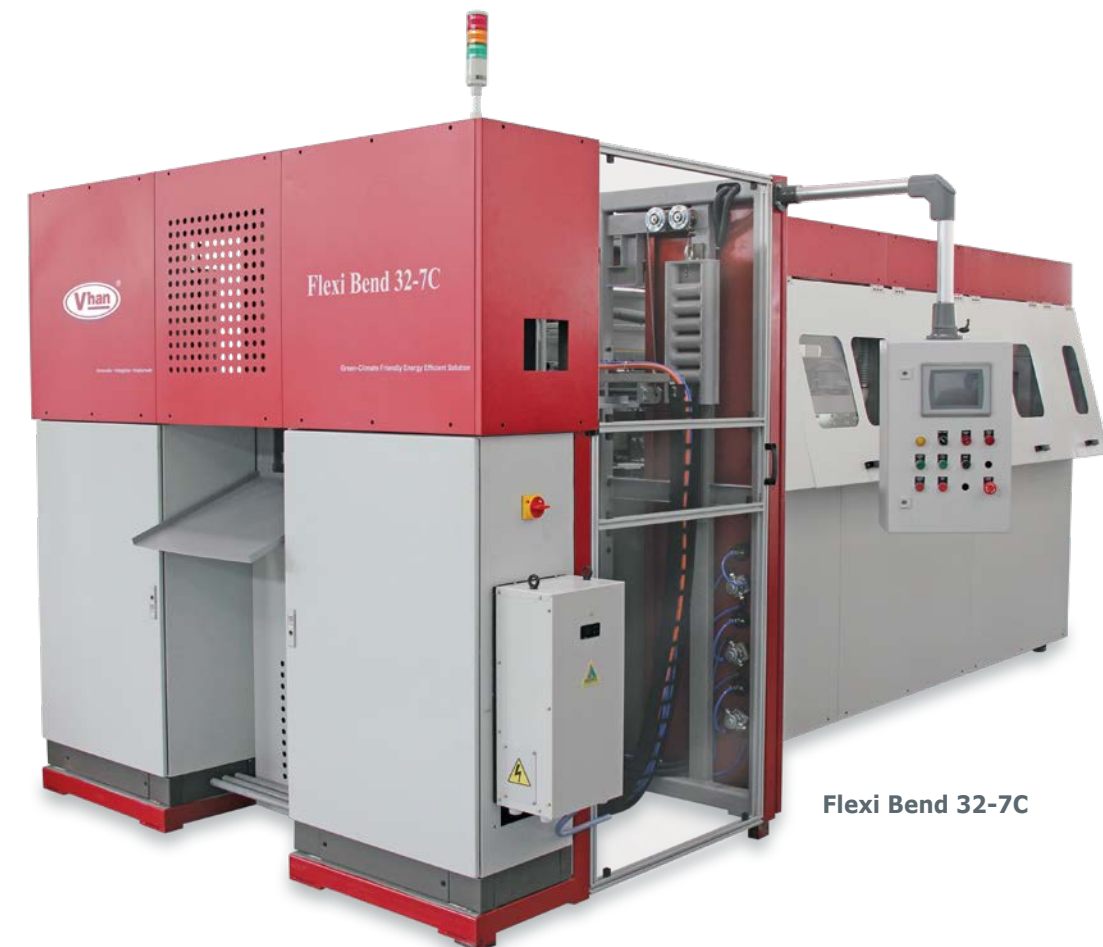
Flexi Bend 32-7C