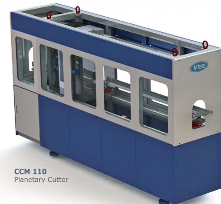
CCM 110 Planetary Cutter